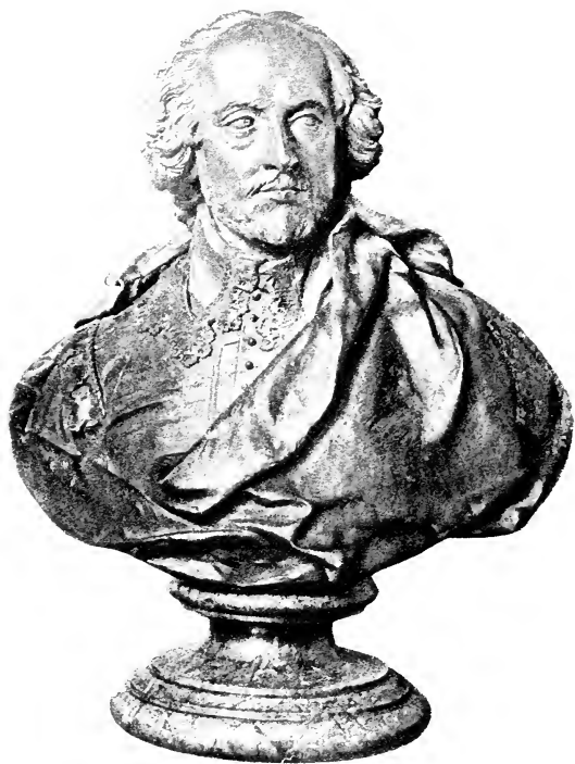
The Garrick Bust by permission of the Garrick club